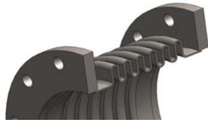
Style 44 (Fixed 150# Plate Flanges)